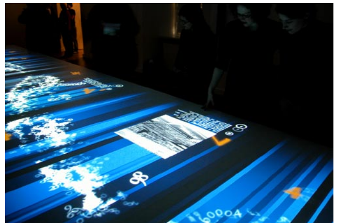
The river of numbers and the selected number "7"