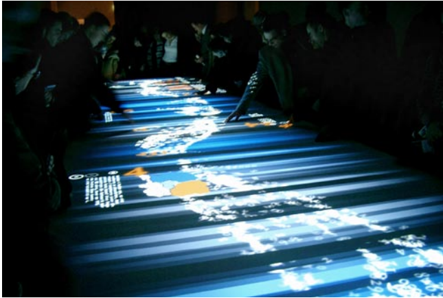
The river of numbers